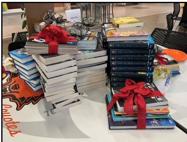
Over 300 books donated by Alpha Mu Chapter