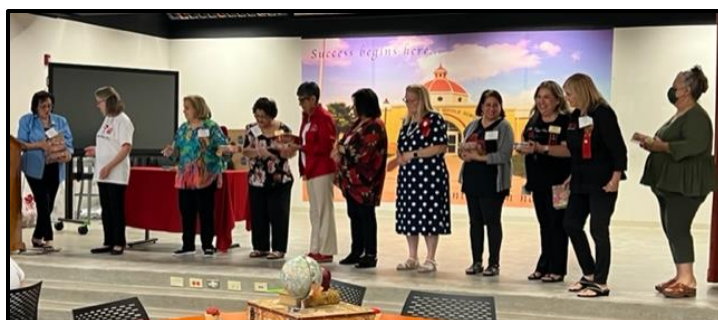
DKG Chapter Presidents