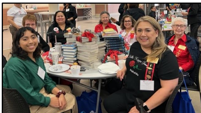
Alpha Mu Chapter Members