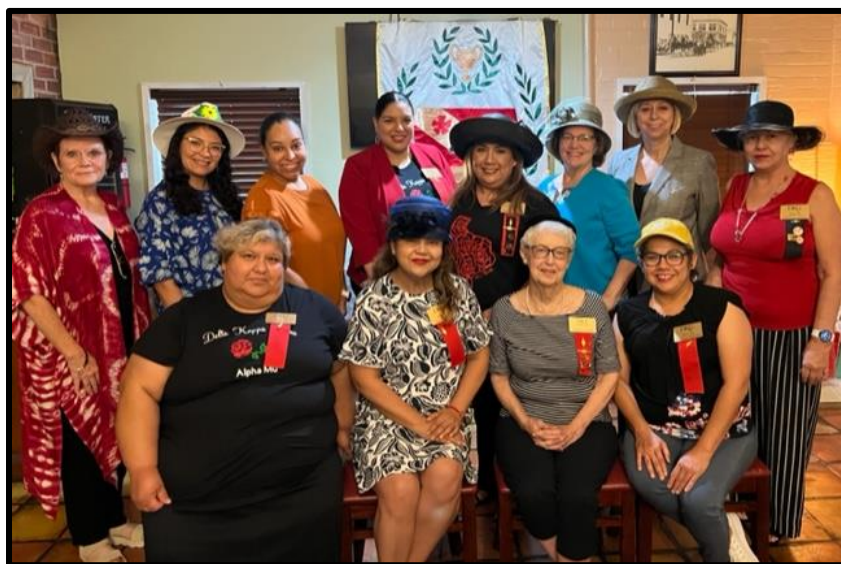
May Founder's Day Celebration!