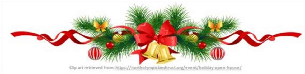
Clip art retrieved from: https://northolympiclandtrust.org/event/holiday-open-house/